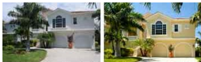
Home before application of NeverFade™ coating (left), and after application (right).

APV Engineered Coatings (Akron, Ohio) announced the introduction of NeverFade™ exterior paint, formulated with Kynar Aquatec® polyvinylidene fluoride (PVDF) fluoropolymer resins and reported to be warranted to last 15 years against fading.