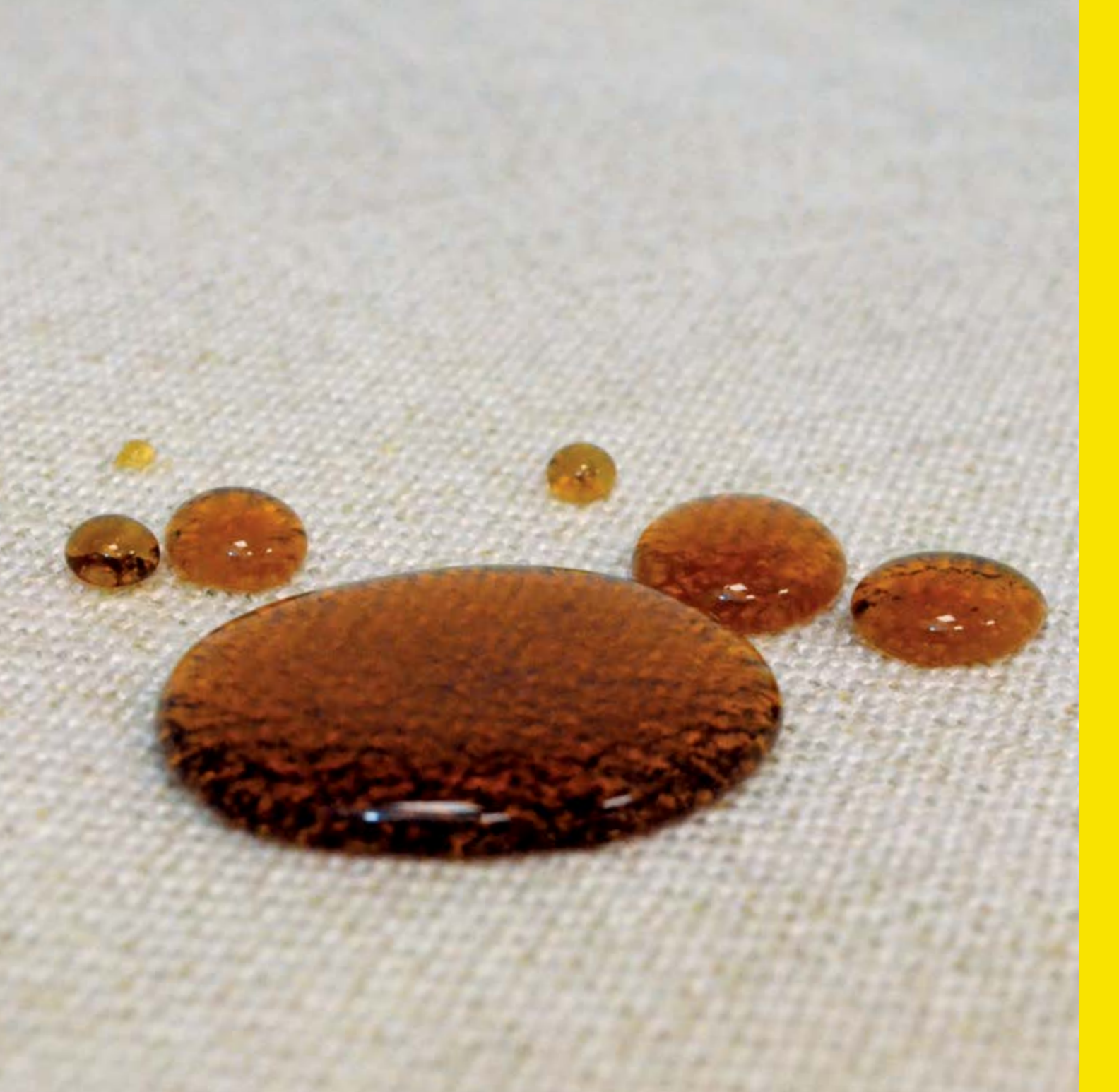
A close-up photo of Vynguard® laquer coated fabric with coffee droplets on the surface during a stain performance test.