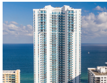
HOLLYWOOD BEACH, FL