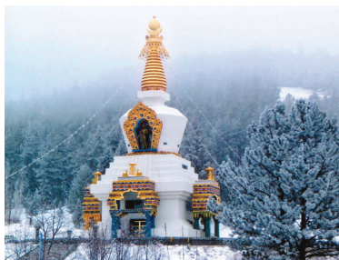
RED FEATHER LAKES, CO